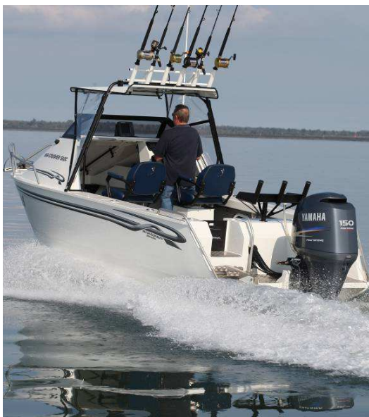
Above: Yamaha's powerful F150A attracts a bonus of $1000

It's not too late! Yamaha is offering savings of up to $2000